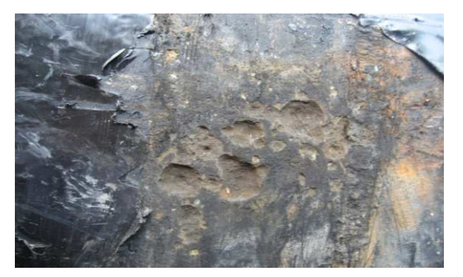
Figure 1 – Corrosion damage to metal pipe

environment are: the chemical nature of soils, their humidity, acidity, resistivity, redox potential, the presence of associations of soil microorganisms etc. The biological factor plays a significant role in damaging the pipes in the underground environment. Soil microorganisms, such as sulfate-reducing bacteria are particularly corrosive, they are involved in the most dangerous variety of corrosion processes, namely, in local corrosion destructions: pitting, ulcerative corrosion under insulation [1]. As a result of the influence of these factors, the degradation of the insulating coating carries out, which leads to its further cracking and peeling, which results in the intensification of corrosion of the pipe metal under the impact of the soil electrolyte (Fig. 1).