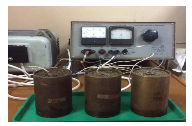
Figure 2 – Unit, used to define corrosive activity of soils

To make a complete conclusion on the corrosive activity of soils, the weight loss of metal calculated by gravimetric method was also analyzed. For this purpose, the metal rods, previously weighed on an analytical scales VLF-200, were placed in the steel cylinders that served as the cathode. A clay fraction (clay selected from above, below, in the middle of the pipeline) was poured into each of the cylinders. The prepared cylinders were left for a specified time under the impact of electric current 6V (Fig. 2).